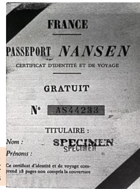
Reproduction of the "Nansen Passport" created by Fridtjof Nansen in 1922.

Nansen's efforts made possible that the passport was recognized by 52 countries. The Nansen Passport was the first travel document for refugees ever and contributed to save the lives of more than 450.000 stateless people and refugees