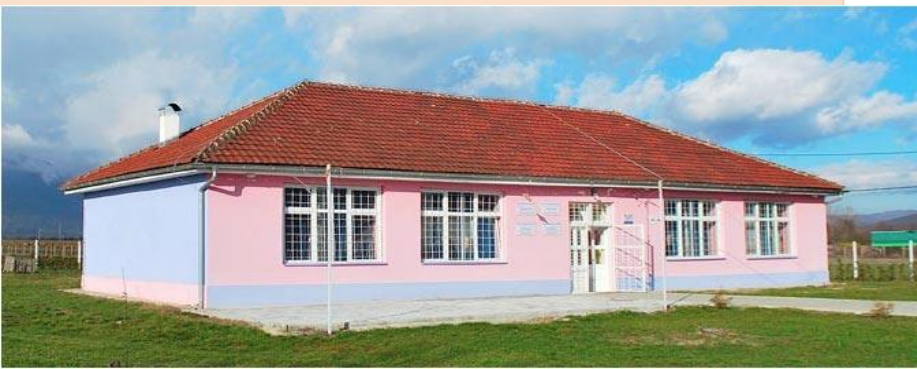
Integrated Bilingual School F. Nansen in Jegunovce, Macedonia