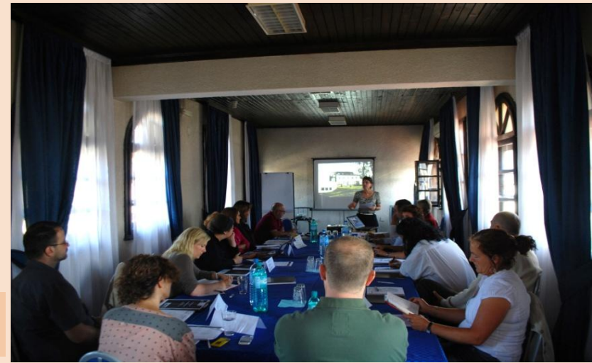
NDN Management Meeting 2010, Skopje