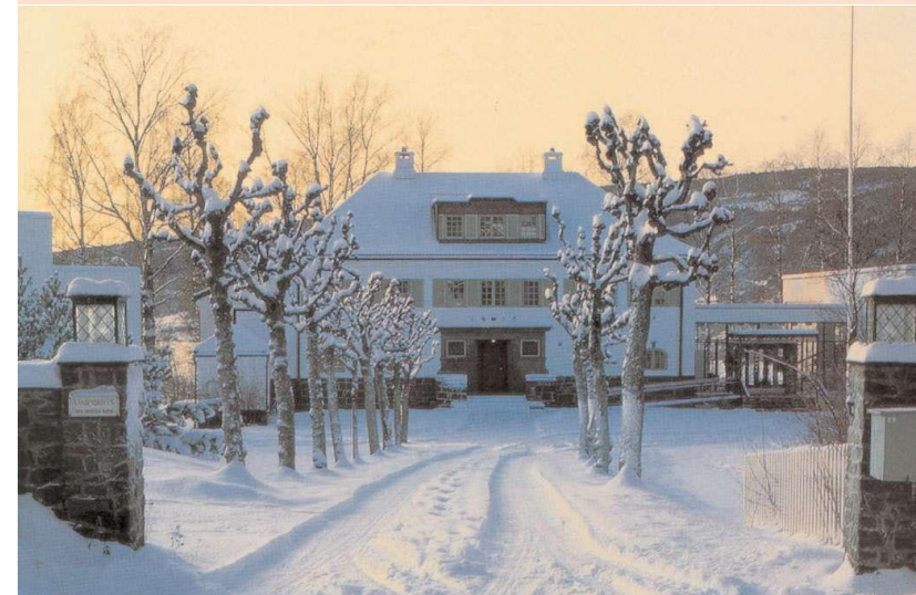
Nansen Academy Headquarters & Nansen Dialogue Network Coordination Centre in Lillehammer, Norway